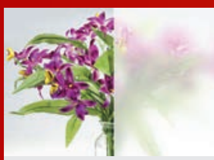
Satin Crystal (NRMV SC)