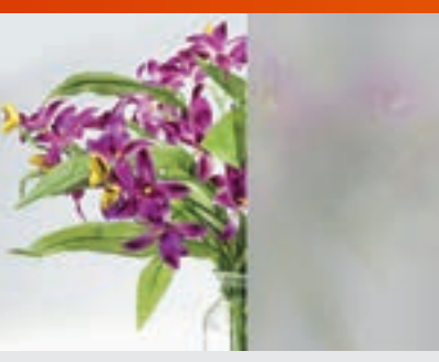
Silver (RMS PS2)