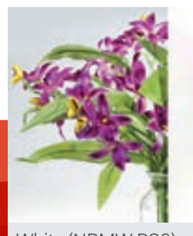
White (NRMW PS3)