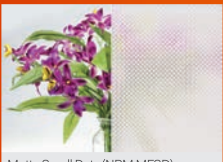
Matte Small Dots (NRM MFSD)