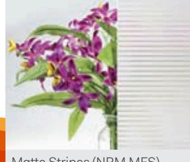
Matte Stripes (NRM MFS)