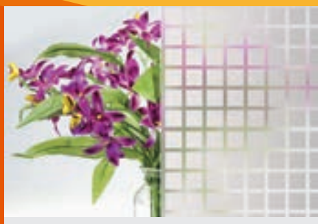
Matte Squares (NRM MSQ)