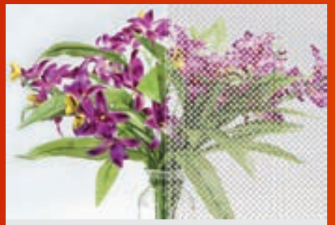
Small Dots (NRM FSD)