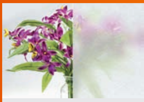
Fiberglass (NRM FIBG)