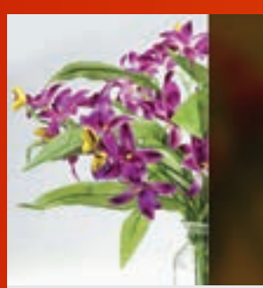
Bronze (NRMB PS2)