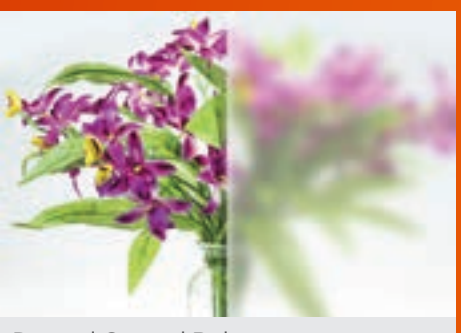
Dusted Crystal Poly