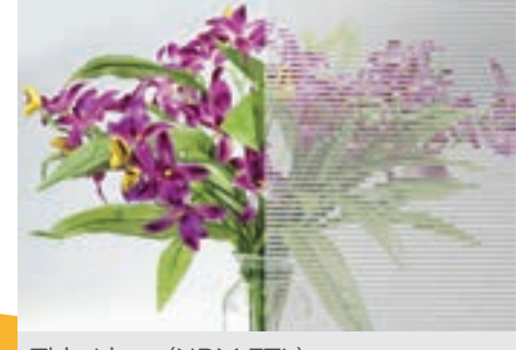
Thin Lines (NRM FTL)