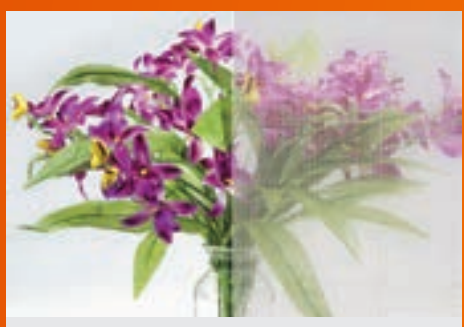
Mini Dots (NRM FMD)